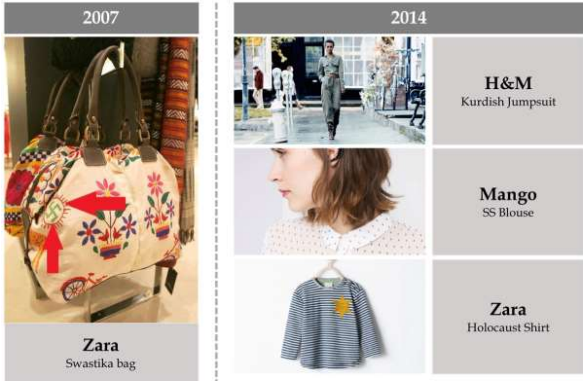
Exhibit 2 Timeline of Incidents